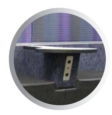
Integrate power modules and data points in easily accessible locations.