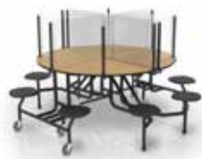
Dividers for Tables, Desks and Rooms