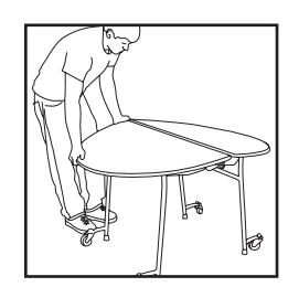
STEP 3 Lift the table at the center while pushing down on edge.