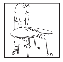
STEP 2 To fully open the table, lift table slightly (1-2 inches) and release Lock Rod