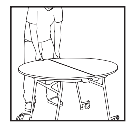
STEP 3 Lower the tabletop to open position.