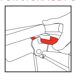
Close-up of Center Lock