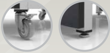
Casters or Glides

Build your table with high quality elements.