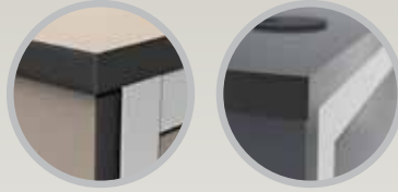
EdgeGuard or PVC