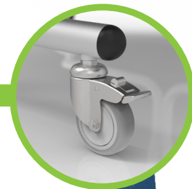
Heavy-duty locking caster.

Available in 48" and 60" round tops in standard height and pub height.