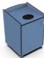
Option #1 • One laminate all sides/top