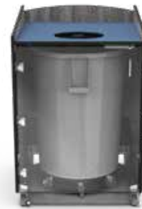
Waste container and dolly included