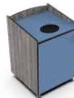
Option #2 • Laminate 1 - three sides • Laminate 2 - front/top