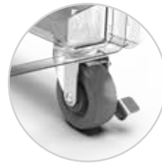
Poly II locking caster wheels