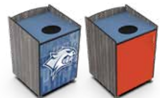
Option #3 • Laminate 1 - three sides • Laminate 2 - top • Logo laminate or a third laminate color on the front.