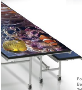
Pocket (86R031412) Bench (42M03151214) Table (40M03273014)