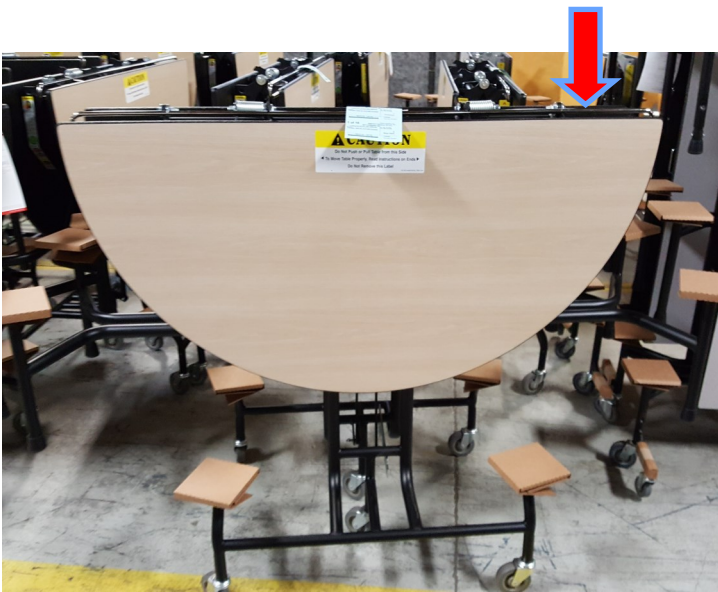
PHID sticker location