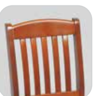
BULL (Wood Bulldog Back) Standard height (Non-stacking): $430 Pub-height: $546