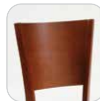
ARL (Wood Arlington Back) Standard height (Non-stacking): $377 Pub-height: $502