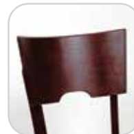
SOL (Wood Solid Back) Standard height (Non-stacking): $430 Pub-height: $546