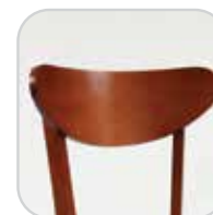
STEF (Wood Stefano Back) Standard height (Non-stacking): $377 Pub-height: $502