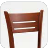
DAN (Wood Danielson Back) Standard height (Non-stacking): $377 Pub-height: $502