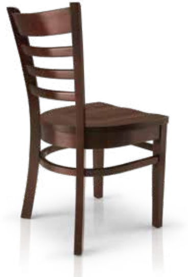
Standard wood ladder back with wood seat