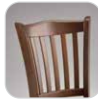
JAI (Wood Jailhouse Back) Standard height (Non-stacking): $377 Pub-height: $502