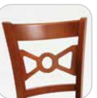
CLEO (Wood Cleo Back) Standard height (Non-stacking): $377 Pub-height: $502