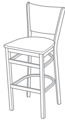
Pub height PH

The durable wood framed chairs offer a more classic style in standard height and pub height.