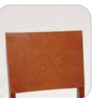
PAUL (Wood Paulina Back) Standard height (Non-stacking): $430 Pub-height: $546