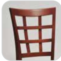
LAT (Wood Lattice Back) Standard height (Non-stacking): $377 Pub-height: $502