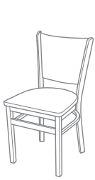
Standard height SH