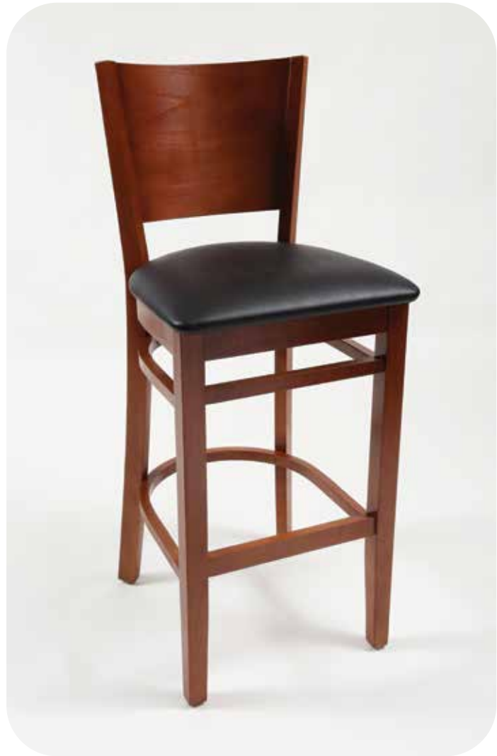
The encore chair selection allows you to define your own style to fit the needs of your space. Build your own chair by choosing your frame style, back style, seat option and colors.