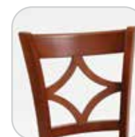
PRIN (Wood Princeton Back) Standard height (Non-stacking): $377 Pub-height: $502