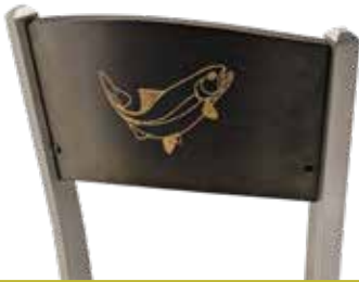
Customize your wood back chair as an added design element to your space. Custom etching also available. (Call for quote.)