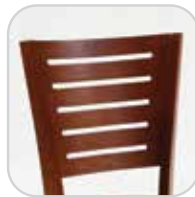
GRET (Wood Gretchen Back) Standard height (Non-stacking): $377 Pub-height: $502