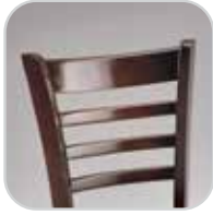
LAD (Wood Ladder Back) Standard height (Non-stacking): $377 Pub-height: $502