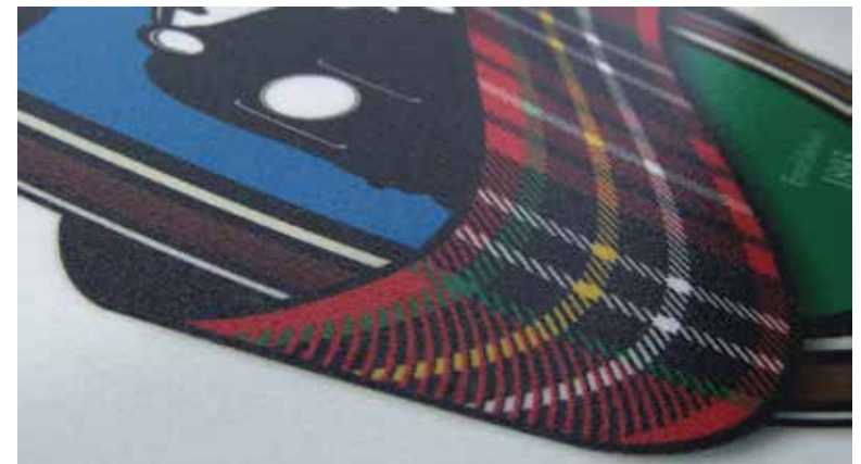
Close-up of an actual sublimation panel; note the high quality printing.