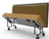
Shown with optional upholstered seat.