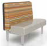
Shown with optional upholstered back.