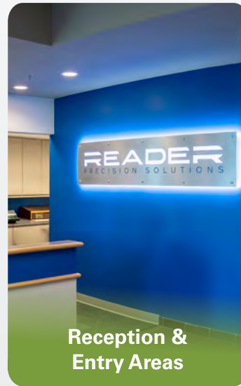
Reception & Entry Areas

Professional environments that elevate learning