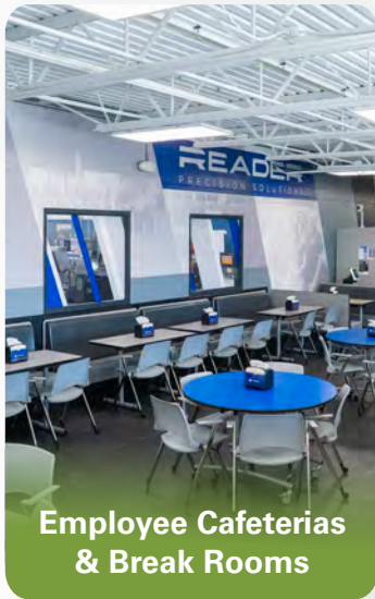
Employee Cafeterias & Break Rooms

Modern spaces that reinvigorate meal breaks