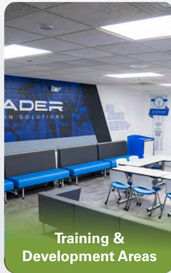
Training & Development Areas

Modern spaces that reinvigorate meal breaks