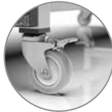
Optional heavy-duty casters